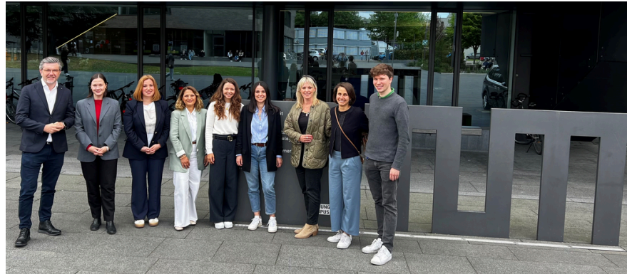
Staff Unit Diversity & Inclusion visits TUM Campus Heilbronn (more on page 2)

Visiting address: Barer Str. 21, 80333 Munich